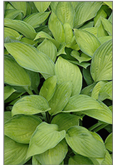
Gold Standard Hosta foliage

Gold Standard Hosta is recommended for the following landscape applications;