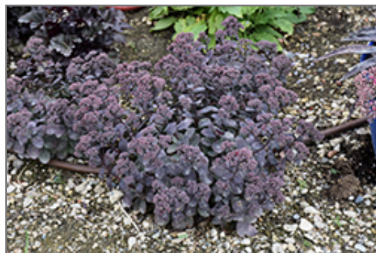
Rock 'N Grow Superstar Stonecrop in bloom