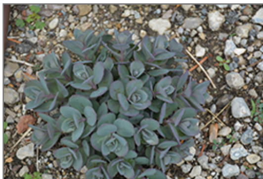
Rock 'N Grow Superstar Stonecrop