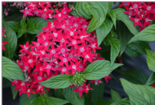
Lucky Star Raspberry Star Flower flowers

Lucky Star Raspberry Star Flower is recommended for the following landscape applications;