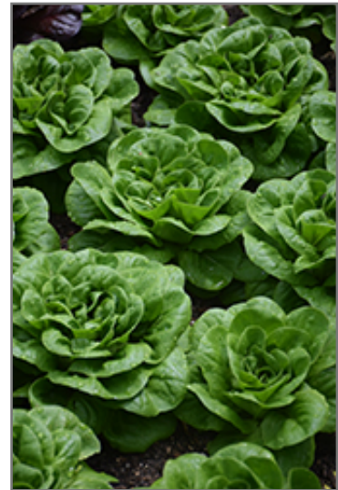
Buttercrunch Lettuce

Buttercrunch Lettuce will grow to be about 12 inches tall at maturity, with a spread of 6 inches. When planted in rows, individual plants should be spaced approximately 8 inches apart. This vegetable plant is an annual, which means that it will grow for one season in your garden and then die after producing a crop. Because of its relatively short time to maturity, it lends itself to a series of successive plantings each staggered by a week or two; this will prolong the effective harvest period.