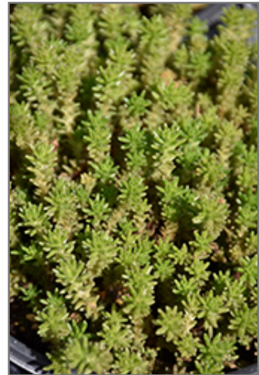
Six Row Stonecrop foliage

Six Row Stonecrop is a fine choice for the garden, but it is also a good selection for planting in outdoor pots and containers. Because of its spreading habit of growth, it is ideally suited for use as a 'spiller' in the 'spiller-thriller-filler' container combination; plant it near the edges where it can spill gracefully over the pot. Note that when growing plants in outdoor containers and baskets, they may require more frequent waterings than they would in the yard or garden.