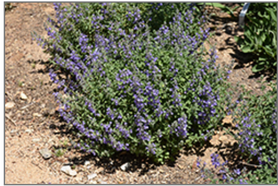
Sylvester Blue Catmint in bloom

Sylvester Blue Catmint is recommended for the following landscape applications;