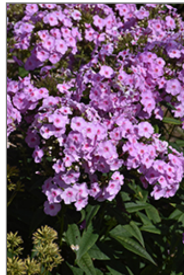
Luminary Opalescence Garden Phlox flowers

Luminary Opalescence Garden Phlox is recommended for the following landscape applications;