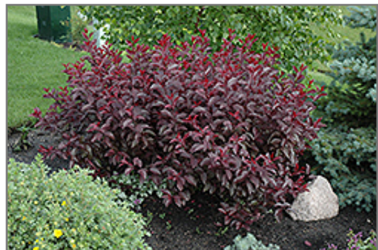
Purpleleaf Sandcherry