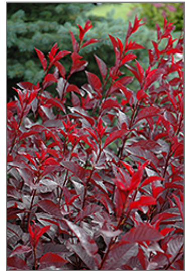
Purpleleaf Sandcherry foliage

Purpleleaf Sandcherry is recommended for the following landscape applications;