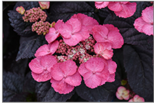
Pink Dynamo Hydrangea flowers

Pink Dynamo Hydrangea is recommended for the following landscape applications;