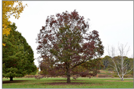
White Oak in fall

White Oak will grow to be about 90 feet tall at maturity, with a spread of 70 feet. It has a high canopy of foliage that sits well above the ground, and should not be planted underneath power lines. As it matures, the lower branches of this tree can be strategically removed to create a high enough canopy to support unobstructed human traffic underneath. It grows at a slow rate, and under ideal conditions can be expected to live to a ripe old age of 300 years or more; think of this as a heritage tree for future generations!