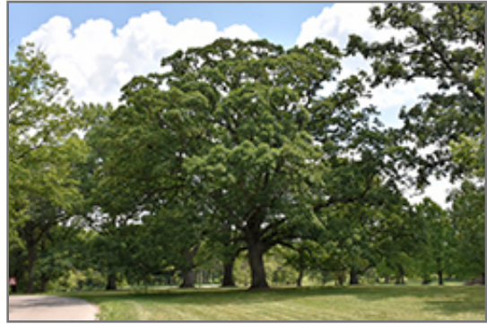
White Oak Photo courtesy of NetPS Plant Finder