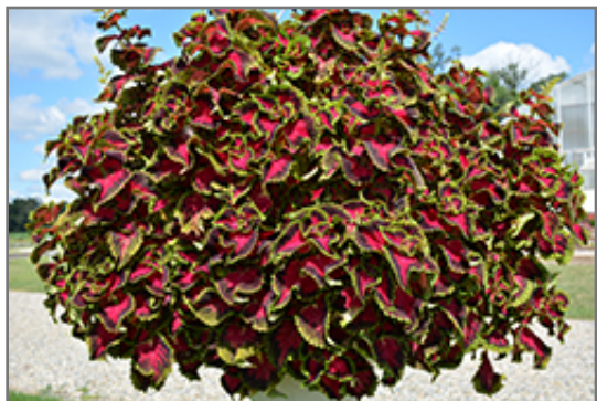
Heartbreaker Coleus