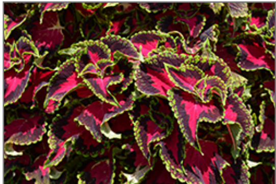
Heartbreaker Coleus foliage

Heartbreaker Coleus is recommended for the following landscape applications;