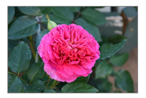
Gabriel Oak Rose flowers