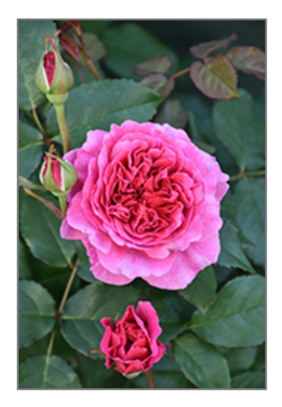
Gabriel Oak Rose flowers