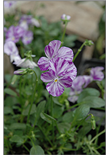
Rebecca Pansy flowers