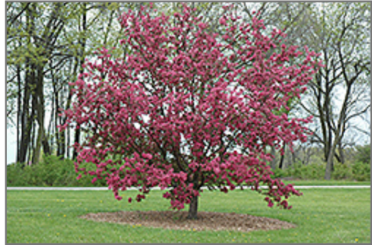
Purple Prince Flowering Crab in bloom

This tree will require occasional maintenance and upkeep, and is best pruned in late winter once the threat of extreme cold has passed. It is a good choice for attracting birds to your yard. It has no significant negative characteristics.