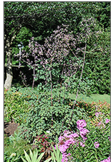
Rochebrun Meadow Rue in bloom