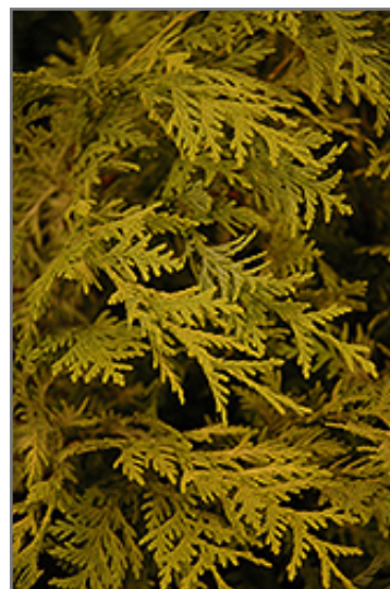
Vintage Gold Dwarf Moss Falsecypress foliage