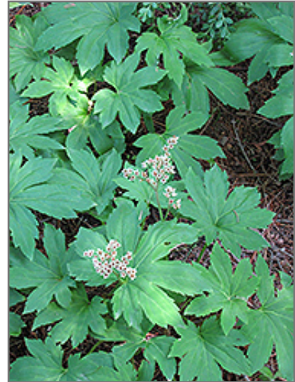
Crimson Fans Mukdenia flowers

Crimson Fans Mukdenia is a fine choice for the garden, but it is also a good selection for planting in outdoor pots and containers. It is often used as a 'filler' in the 'spiller-thriller-filler' container combination, providing a mass of flowers and foliage against which the larger thriller plants stand out. Note that when growing plants in outdoor containers and baskets, they may require more frequent waterings than they would in the yard or garden.