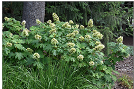
Alice Hydrangea in bloom